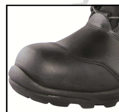
Rubber pump cap

UPPER 2,2 ± 0,2mm black grain leather, Fire resistant and waterproof, Combined with a breathable fabrics highly resistant to abrasion.