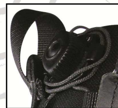
Boche Lacing System